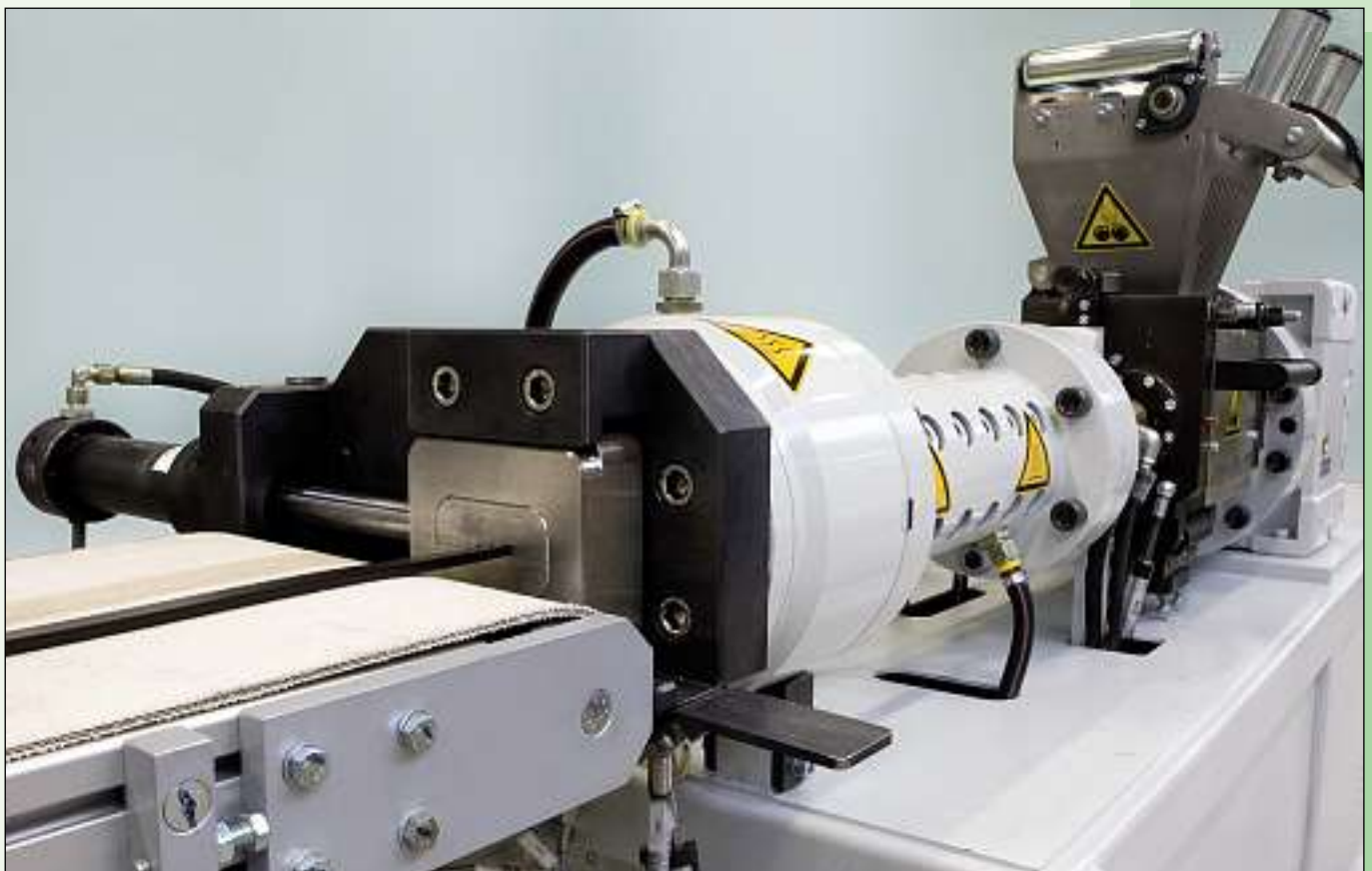
VMI-AZ Pin-barrel Extruder with quick die change head

Single sourcing the entire line from VMI offers many benefits to the user, as production of dimensionally stable apex strip is the key to the correct functioning of the line.