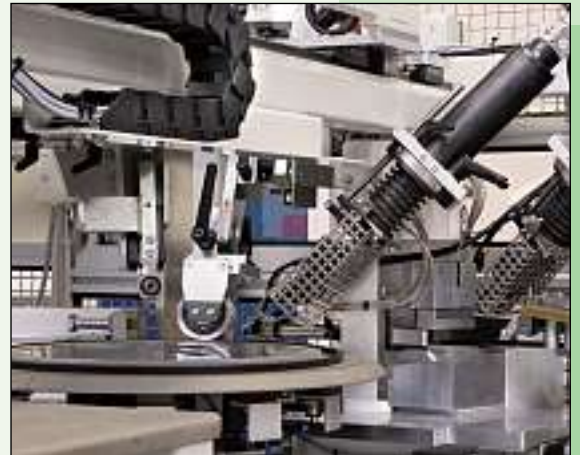
Single station APEX Applicator

Direct extrusion combined with automated apex application ensures a consistently high quality of apexed bead which is ideally suited for use in automated tire building systems for the manufacture of high quality tires.