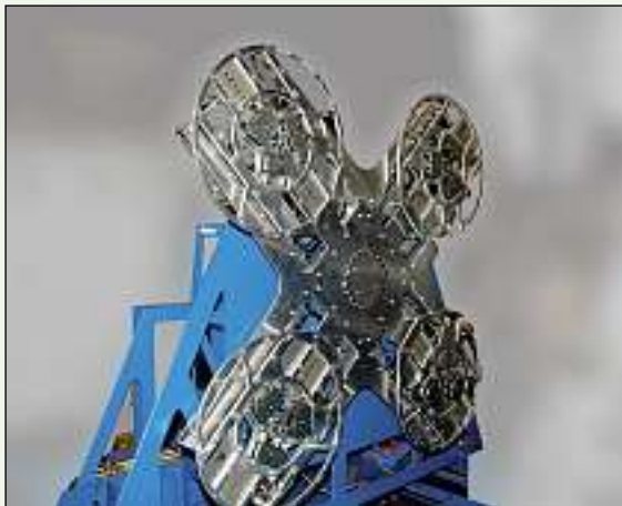
Four station Application

This sophisticated system is designed to process beads up to 24" diameter, and can apply apexes from 20mm up to 70 mm in height.